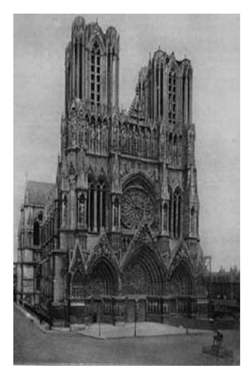
THE CATHEDRAL AT REIMS